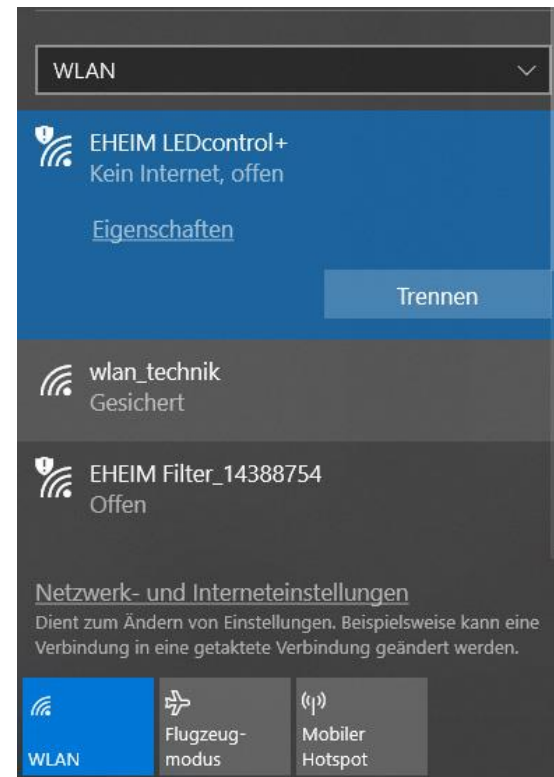
When connected to the network