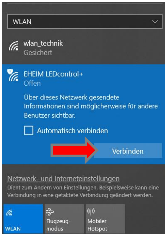
To connect to the network